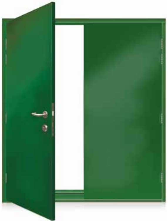
ExcluDoor® 1 FR

Specialist transport service includes curtain sider lorries with Moffett facility, flat bed lorries with HIAB facility and lightweight vans as applicable.