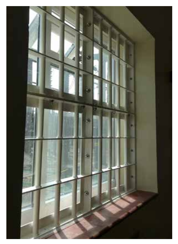
ExcluGrille® 1 to 4

Specialist transport service includes curtain sider lorries with Moffett facility, flat bed lorries with HIAB facility and lightweight vans as applicable.