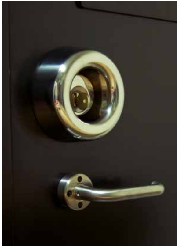
External locking option of lever handle and high security cylinder guard.

Specialist transport service includes curtain sider lorries with Moffett facility, flat bed lorries with HIAB facility and lightweight vans as applicable.