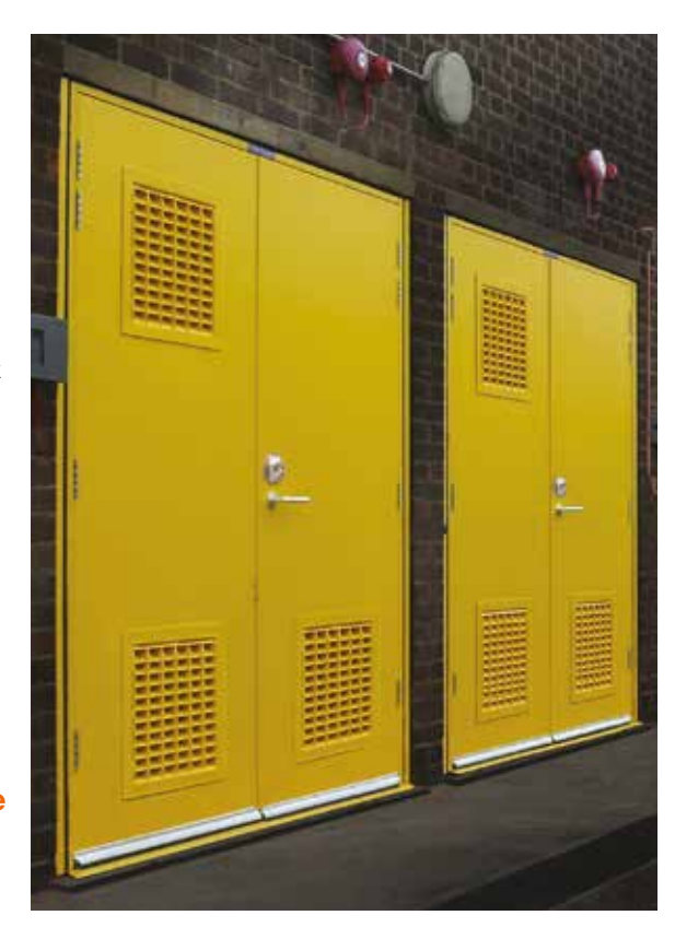
ExcluDoor® 5 double doorsets fitted with ExcluVent® 5 ventilated panels.

Specialist transport service includes curtain sider lorries with Moffett facility, flat bed lorries with HIAB facility and lightweight vans as applicable.