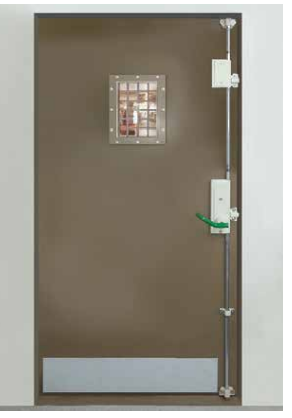
'Extra high' ExcluDoor® 4 incorporating 4-point locking system fitted with kickplate and ExcluGlass® 4 vision panel as extras.