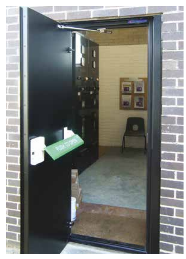
ExcluDoor® 3 Mk2 fitted with single point locking system incorporating a panic bar and with optional heavy duty door stay.

Specialist transport service includes curtain sider lorries with Moffett facility, flat bed lorries with HIAB facility and lightweight vans as applicable.