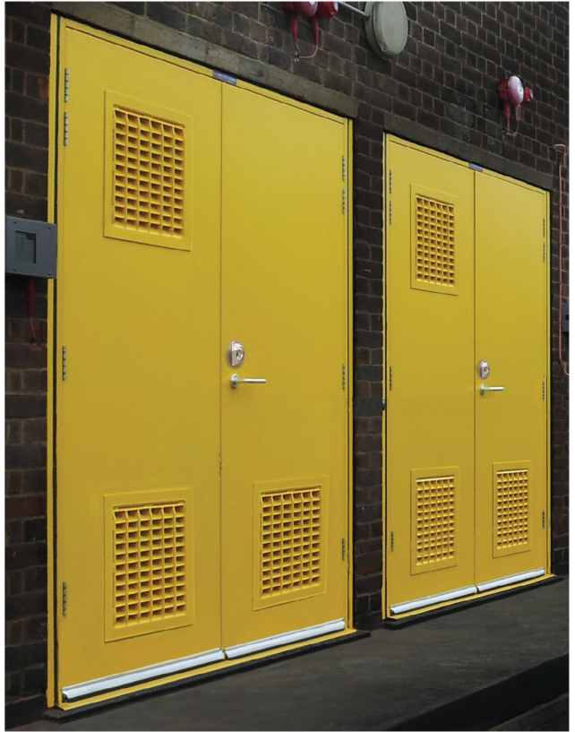
ExcluDoor® 5 double doorsets fitted with ExcluVent® ventilated panels.