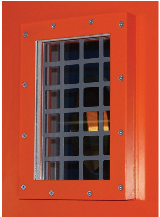
ExcluGlass® 4 FR